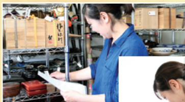
1.Transfer merchandise to packaging room.

My biggest concern is always the safe delivery of the merchandise to our customers. I pay utmost attention to make sure the correct merchandise is delivered for the complete satisfaction of the customer.