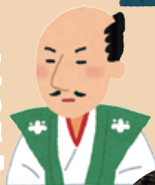
織田 信長 Nobunaga Oda