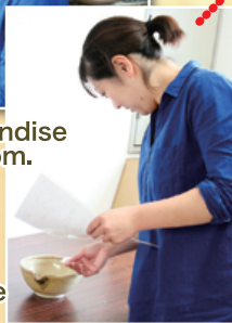
2.Double check the merchandise.