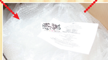
4..Insert thank you card.