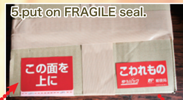
5.put on FRAGILE seal.