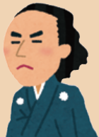
坂本 龍馬 Ryoma Sakamoto