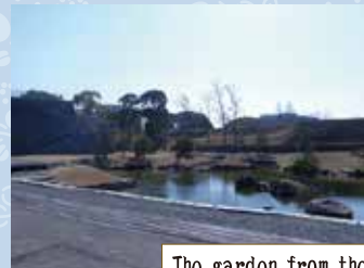
The garden from the viewpoint of lord's room

From the room of lord, the view of garden was the best. Might the lord have spent a time with his wife with seeing a moon? In such a spacious garden, his wife's room was just next to the lord. It is so excellent. (Near the lower-left in the left picture)