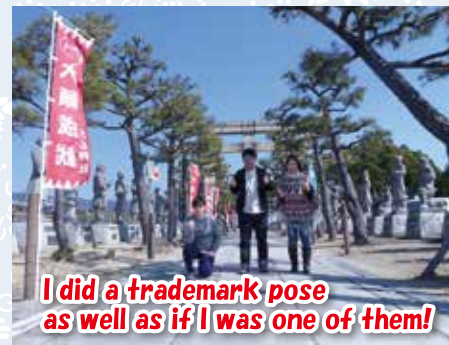
I did a trademark pose as well as if I was one of them!

Next, we visited Ooishi Shrine where the forty-seven loyal retainers of the Akoh clan were enshrined. The statues of them were standing on both sides of street to the entrance of shrine. They had an atmosphere like saying welcome to us.