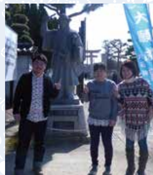
The tomb of Oishi Kuranosuke

After going though Torii, you can find Daikoku-sama, the statue of luck and matrimonial happiness, on your left