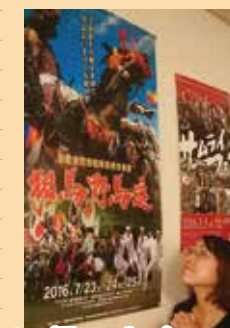
I will make it sure to visit here