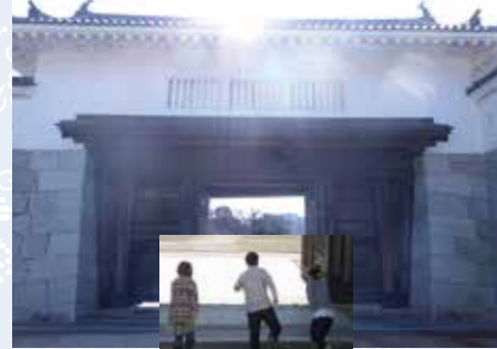
It is so huge! Let's go!

From the room of lord, the view of garden was the best. Might the lord have spent a time with his wife with seeing a moon? In such a spacious garden, his wife's room was just next to the lord. It is so excellent. (Near the lower-left in the left picture)