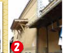
2 I was able to find a warehouse just beside the shrine!!