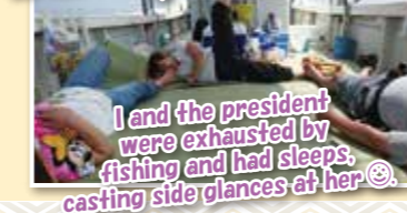
I and the president were exhausted by fishing and had sleeps, casting side glances at her.