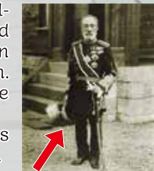
He did very well in the Russo-Japanese War and was called 'General Nogi'.

Bunnoshin who taught Shoin instructed Maresuke Nogi, his relative and an army general, as well.