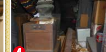
4 I detected tons of treasures sleeping for long time.....