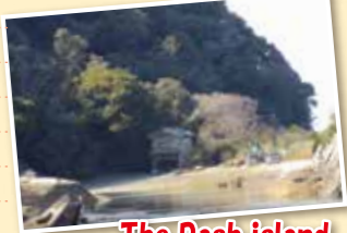
The Dash island