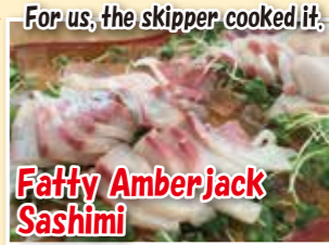
Fatty Amberjack Sashimi

He saw the scene that we were eating his served foods very happily and said to us, 'I never permit guests who have unpleasant faces without getting any fishes. I am not a fisherman. This boat is a pleasure boat. Even if guests can catch no fish, I would like them to enjoy riding my boat and going back to home in high spirits. The sight my guests enjoy very much pleases me very much'. He showed what he thought in his hot heart. By the way, he took us to the Dash Island when I went fishing for black rockfish for the first time and did not catch so many fishes. I called back this memory. His causal kindness made me happy. Since that time, I became a fanatic fan of the skipper who had a faithful mind 'to make my customers joyful'. I wanted to make efforts everyday to let my clients pleased and smile. I will definitely get the 'Hanaemon Prize' next year.