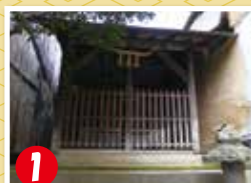
1 Wow, a shrine in his site!!

A relative of client passed away. He succeeded his relative's heritage and found many antique works of art. He wanted to give what he inherited to a person who would treat them valued. Then, he requested me to buy his heritage and I went to his certain residence.