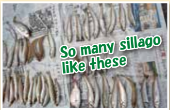
So many sillago like these

In this sailing, we used the Kazumaru Tourism as well