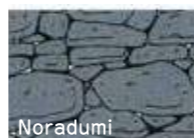
Noradumi As natural unprocessed stones were piled up as they were, this wall had a lot of spaces between stones. They look uneven.

When Hideyoshi renovated the castle, he is said to order Kanbee to design and carry out the actual works. The stone wall was allegedly built at that time. 'Noradumi' is a method of construction to accumulate natural stones almost as they were. The method was a primitive way of masonry. In those days, the skills to pile up stones highly were too poor. So, like in this picture, the wall has dual-layer structure separated from the top and bottom stone walls. While, at a glance, the wall seemed to have been an old-fashioned method to construct stone walls, it was evaluated by lords of castles in the next generation because the dual-layer structure made the wall an excellent feature. And it also cut down expenses by utilizing natural stones. That might be the very reason to enable Himeji Castle to leave in the present day.