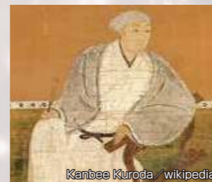
Kanbee Kuroda

I suppose many readers might ask if the title of NHK Taiga drama series aired four years ago had been 'A tactician, Kanbee' as well. However, there was no position of tactician in governmental posts and job positions of Japan in the first place. But I guess nobody argued that he was a right-hand man of Hideyoshi Toyotomi who had united a whole country.