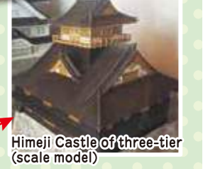
Himeji Castle of three-tier (scale model)

When Yoshitaka Kuroda (Kanbee) was the lord of castle, he gave this castle to Hideyoshi unexpectedly because Kanbee thought the castle would be very important for attacking Chugoku Region by the Army of Nobunaga. Hideyoshi rebuilt the castle and made it the three-tier castle. And, after Battle of Sekigahara in 1600, Terumasa Ikeda had the castle. He spent nine years and refurbished to the current five-tier seven-storey castle. When I entered the inside of castle, I thought 'How do soldiers make an attack to such a castle?' The structure has a lot of invention as I mentioned before.