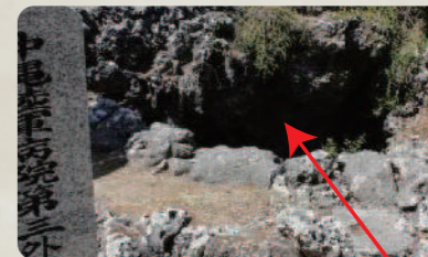
Gama(the cave, shelter)

It is a memorial to the 'Himeyuri students' who were sent to the battle fields as nurses and killed. The cave with a big hole in front of the Himeyuri Monument is the site of the shelter where the Third Department of Surgery, Okinawa Army Hospital. In Okinawa, caves and shelters were called 'Gama' in the Okinawan dialect. At that time, there were about 100 people of medical staff, Himeyuri students, residents and so on in the cave where Himeyuri monument is now established nearby. On June 19th after the dissolution order of hospital, the attack with gas by US troops killed over 80 people in the cave.